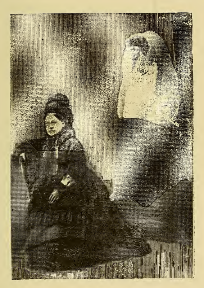
LADY AND THE SPIRIT OF HER FATHER.