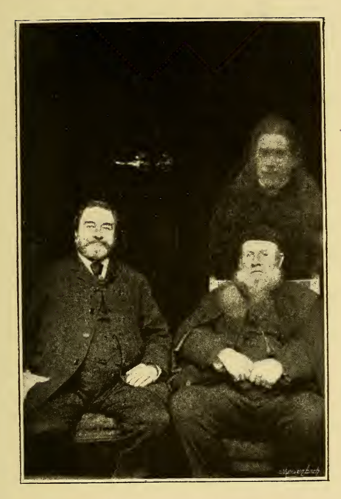
ABNORMAL PORTRAIT OF LADY