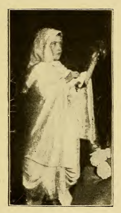
Part of a Stereoscopic pair of Spirit Photograph obtained by a Lady October 21 1893.