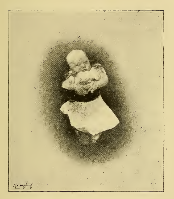
PSYCHIC PICTURE OBTAINED WITHOUT A CAMERA.