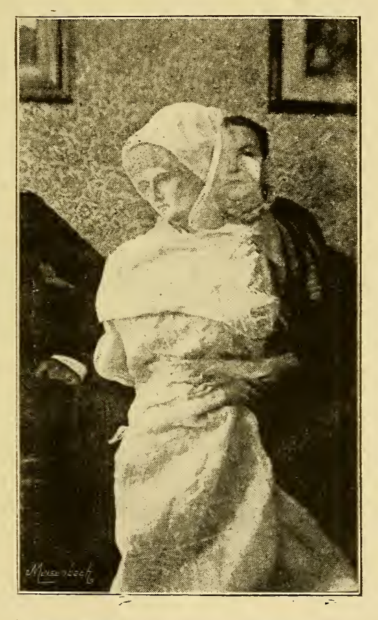
From a Photograph taken April 29, 1892. Two Stereoscopic photographs of this form were obtained with different sitters, May 2, 1892.