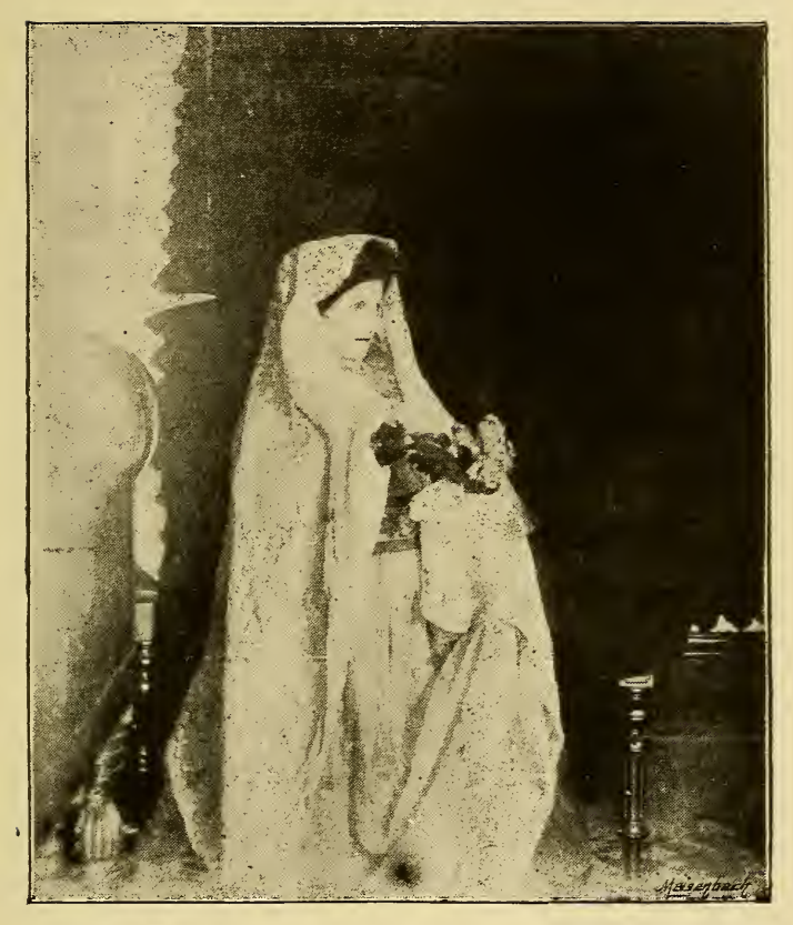
Spirit form. Part of a Stereoscopic pair. The sitter (who does not wish his portrait to appear) has obtained spirit photographs with his own camera and plates, when no other medium but himself was present, and all manifulations were done by himself.