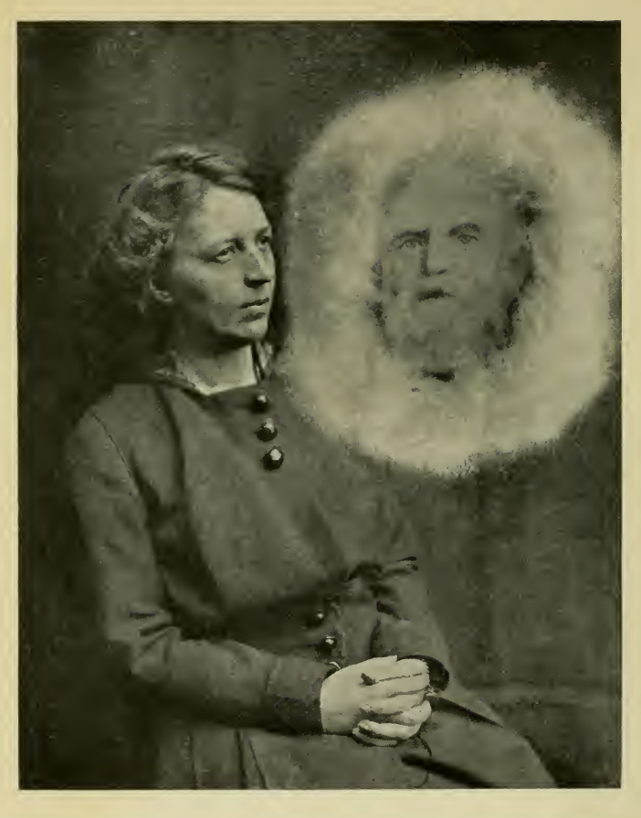
Psychic Photograph of W. T. Stead given at Crewe, 1915. See Introduction.